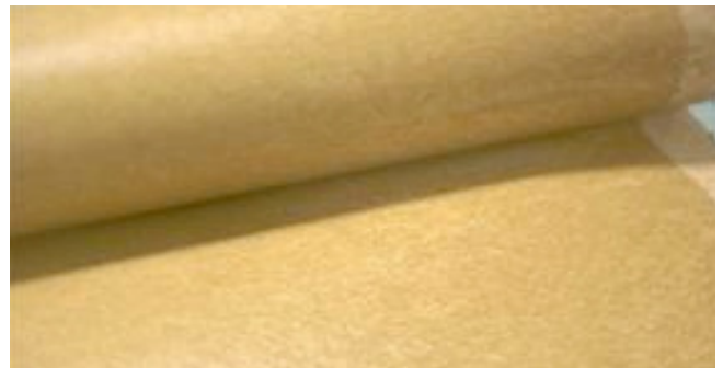
Inhibits silica & inorganic scales